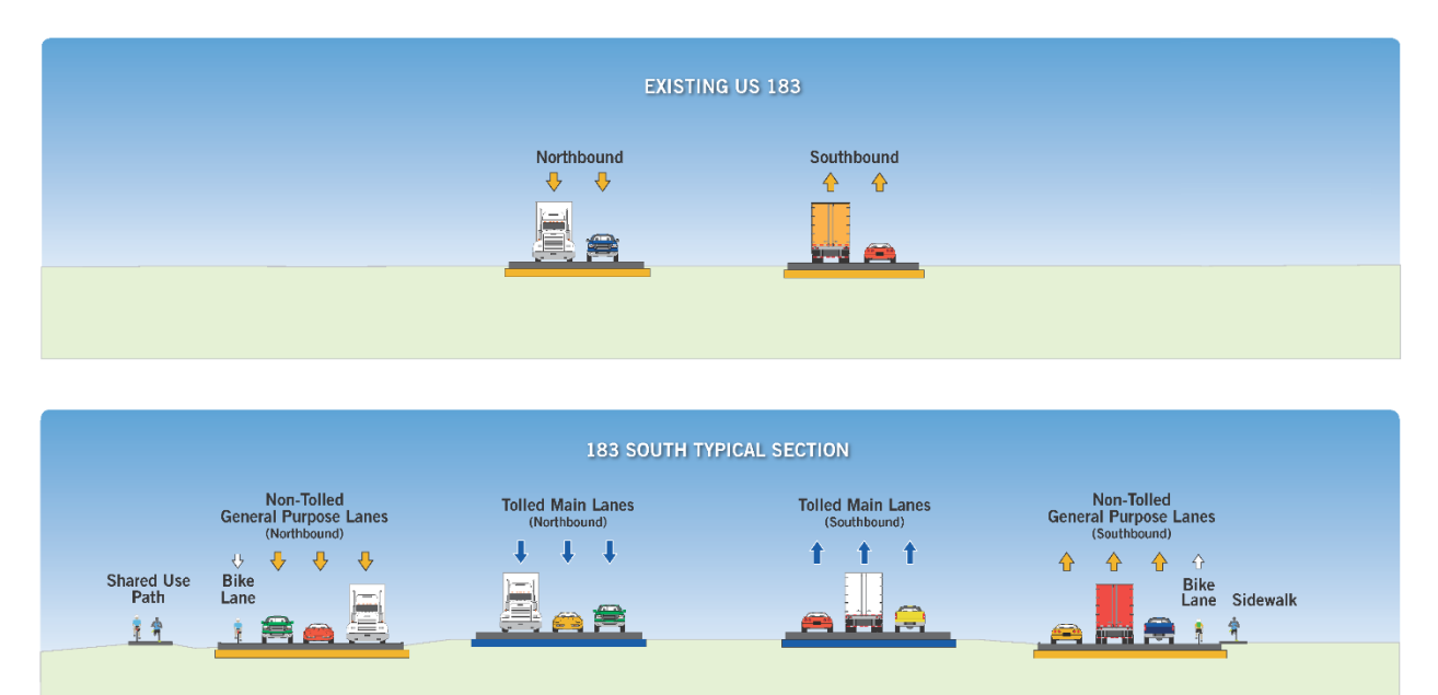
Figure 2 - Typcal Sections

Existing and proposed typical sections are illustrated in Figure 2.