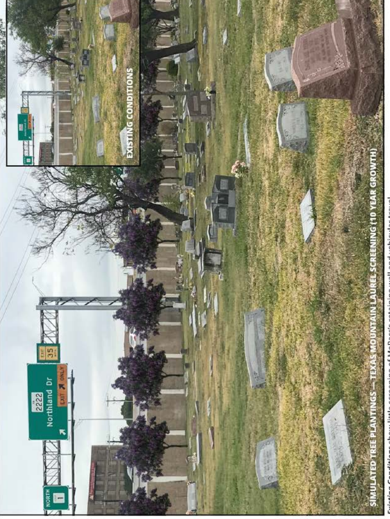
Existing Conditions show little screening of MoPacs's retaining wall and vehicular travel.

The simulated tree plantings represent approximately ten years of plant growth after installation. To maximize their screening effect, a spacing of approximately 20 ft. is recommended.