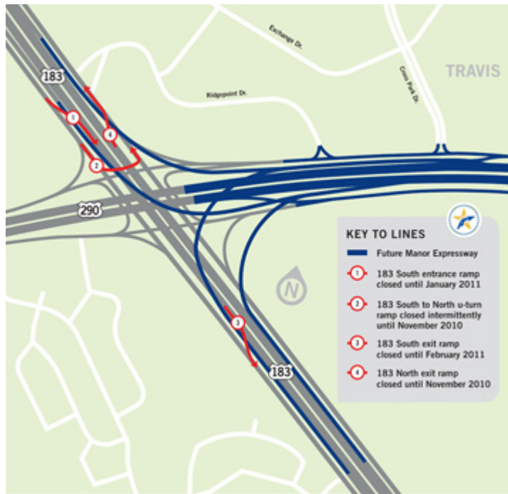
Temporary Ramp Closures

Construction of the Manor Expressway direct connect flyover interchange at US 183 and US 290 began in March.